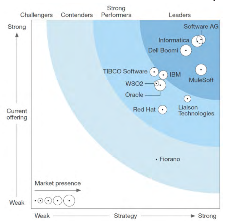
The 11 Providers That Matter Most And How They Stack Up